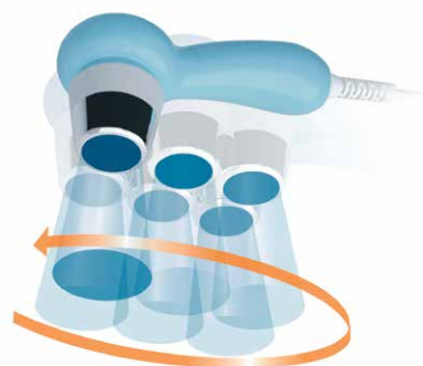
Hand operated application by a therapist