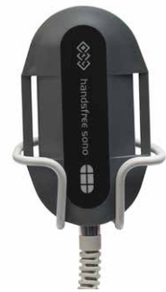
HandsFree Sono® holder for plastic trolley