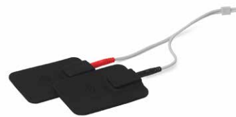
Re-usable rubber electrodes (5x7 cm)