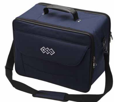
Carry bag for BTL-4000 Smart/Premium