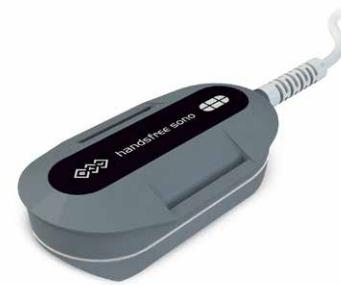
6 crystal HandsFree Sono® applicator