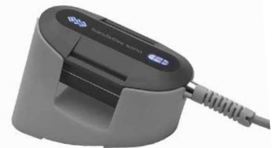
Plastic holder for HandsFree Sono®