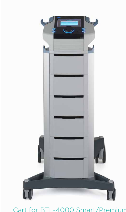
Cart for BTL-4000 Smart/Premium