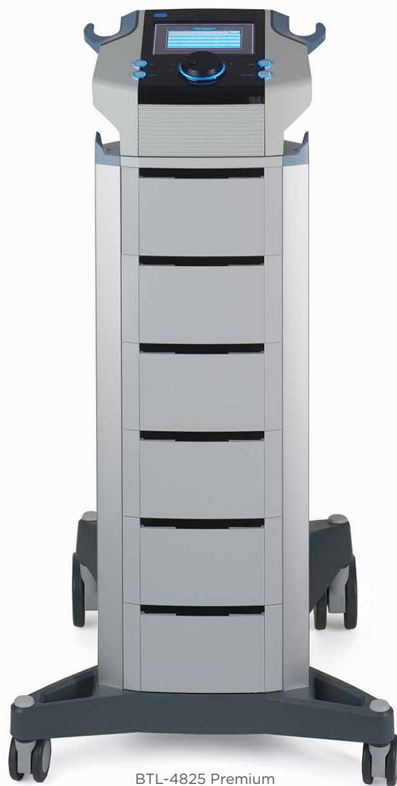
BTL-4825 Premium with optional trolley