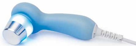
5 cm 2 applicator