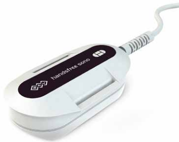
4 crystal HandsFree Sono® applicator