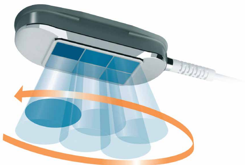
Automatic application by the HandsFree Sono®

The BTL HandsFree Sono® brings the unique Rotary Field Technology. It is the first ultrasound applicator on the market which creates electronically precise rotating ultrasound field without necessity of a therapist activity. This outstanding technology enables very fast, effective and comfortable treatment and reduces operator fatigue.